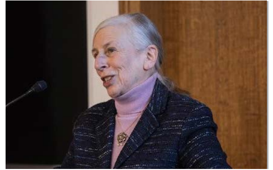
Schlozman explains party affiliation by religious group.

View the recorded Wolfe Lecture on the Boisi Center's YouTube channel.