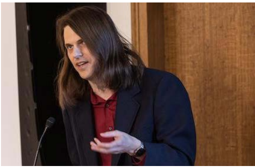
Hopkins explaining politics' influence on religion.

years and remain relatively faithful until they have children—and then must confront the role they want religion to play in their childrens' lives. During this time apart from religion, Americans' political beliefs mold and take shape; ergo, when people reconsider their religious beliefs, their political beliefs are influencing them. Furthermore, Hopkins mentioned