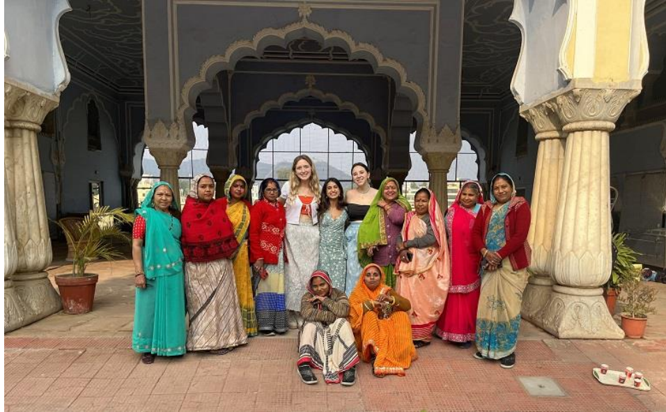
Students in Jaipur, India

Summer grants were awarded to students who participated in unpaid summer internships at various organizations focusing on healthcare research and advocacy, the history of redlining, human-centered engineering, US-Asian relations, criminal justice, and museum education. Travel grants were also awarded to students who participated in opportunities that supported their career interests, including global poverty, disaster nursing, filmmaking, photography, and education research. Three students also received a grant to attend the GenHERation Discovery Days program, which connects young women with female leaders from Fortune 500 companies, tech giants, government agencies, retail, the sporting industry, and other companies for networking and mentorship opportunities.