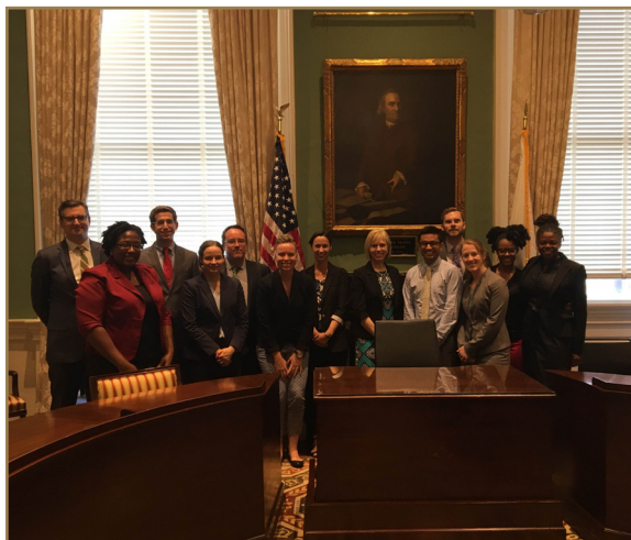
Fellows meeting at the Office of the Governor's Legal Counsel