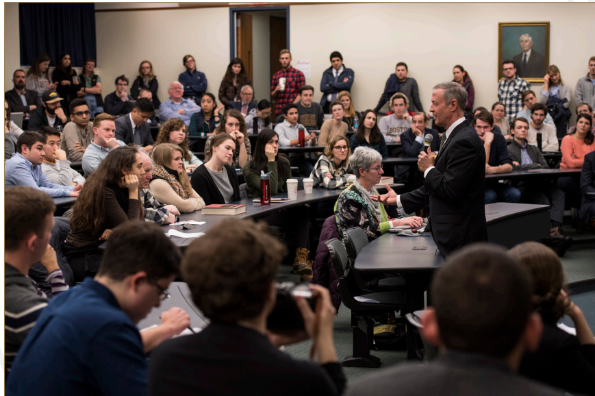
Rappaport Distinguished Visiting Professor Martin O'Malley presenting to students and faculty