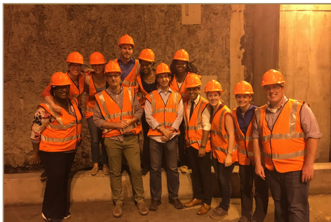
Big Dig Tour

During the summer, the Rappaport Fellows meet on a weekly basis to experience the intersection of law and public policy. The Fellows have a chance to speak with elected officials, government representatives, lawyers, and community leaders. Topics range from municipal governance, urban planning, criminal justice, education, transportation, and the three branches of government.