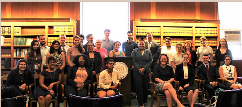
The Rappaport Center and Institute Fellows with Suffolk County District Attorney Rachael Rollins