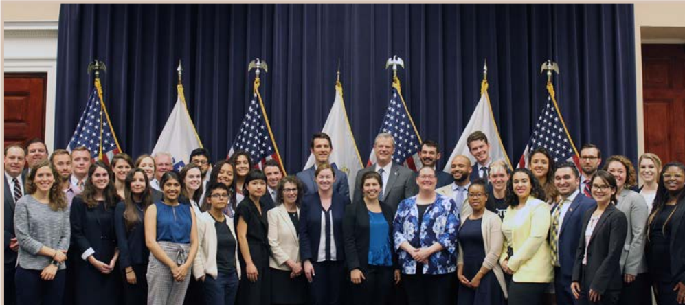
The Rappaport Center and Institute Fellows with Massachusetts Governor Charlie Baker