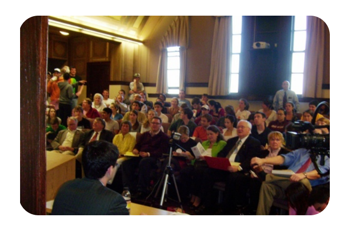
The audience gathers to watch the 118th Fulton Prize in the Fulton Debate Room (Gasson 305).