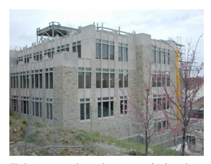
Work continues on the new lower campus faculty and administration building. Fulton Debate will be moving to a new suite of offices on the fifth floor of this building later this fall.