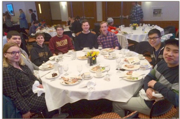
ADA Debate Banquet: Fultonians feast on roast herb crusted prime rib, lasagna, chicken breast with roasted mushroom sauce, clam chowder, Caesar salad, rice, vegetable medley and chocolate cake