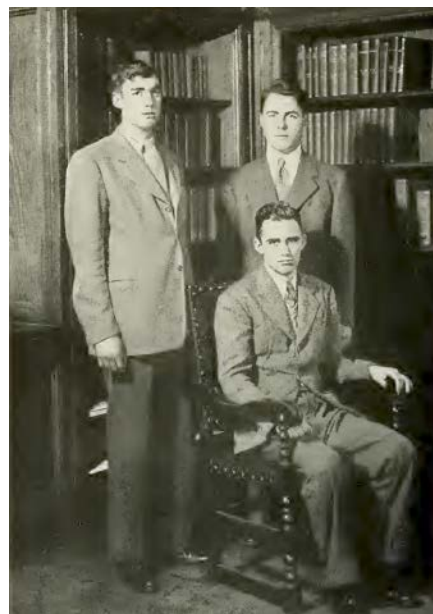
Marquette Debating Society of 1942