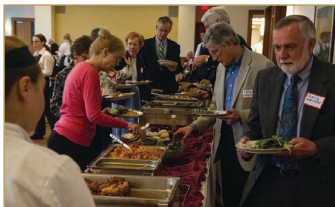
The Buffet at the 2013 BCARF Annual Banquet.