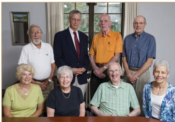
Executive Committee 2012-2013