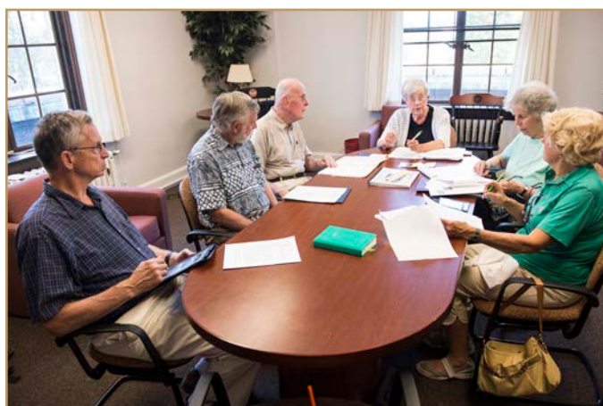
Executive Committee 2014-2016