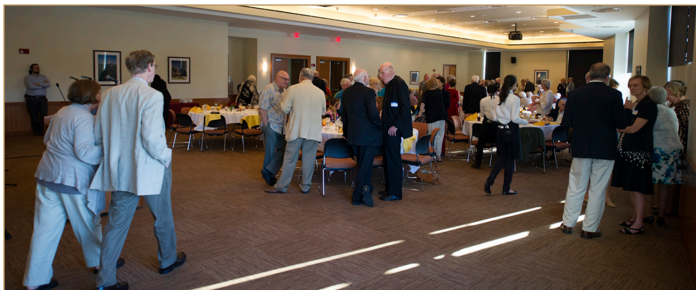
Guests arrive and mingle at the 2014 Annual Banquet