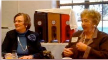
ARF Book Club