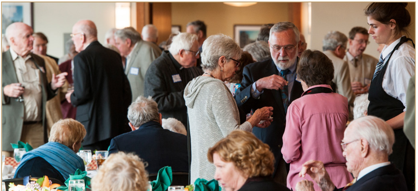
Guests arrive and mingle at the 2015 Annual Banquet