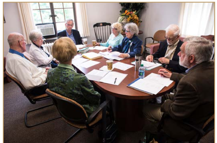
Executive Committee 2015-2016