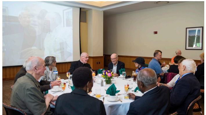
A group enjoying their dinner at the banquet.