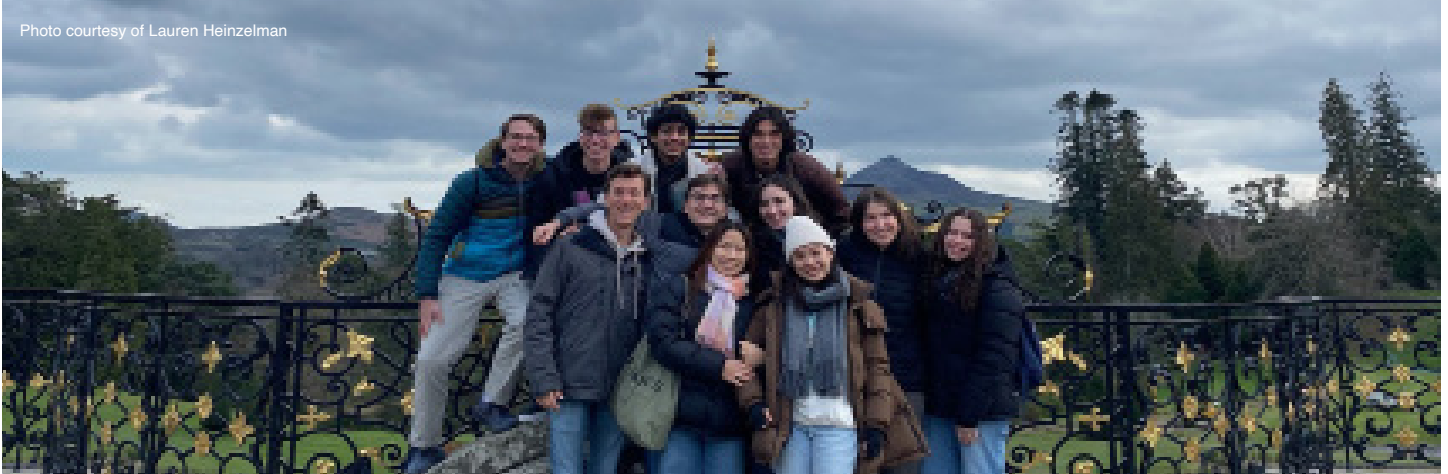
The freshmen stop for a group picture while sightseeing