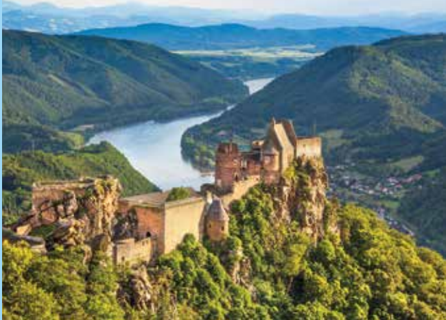
Cruise along the Danube River through the stunning natural beauty of the Wachau Valley landscape, a UNESCO World Heritage site.