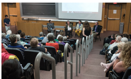
A diverse crowd of faculty, staff, students, and local community members engage in the discussion.