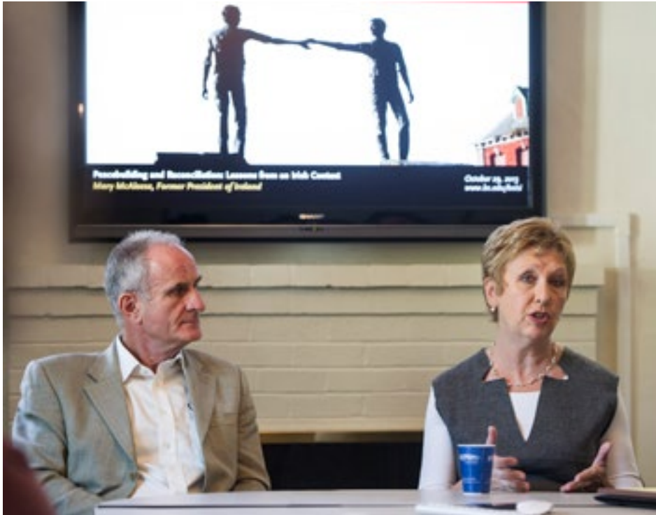
Former president of Ireland Mary McAleese speaking at the Boisi Center on October 29. She was joined by her husband Martin. Together, they played crucial roles in cementing peace in Ireland.

How does a nation move beyond decades of sectarian violence to peace? At an intimate Boisi Center lunch in October, former Irish president Mary McAleese spoke to a packed room about her work helping to broker peace in Ireland.