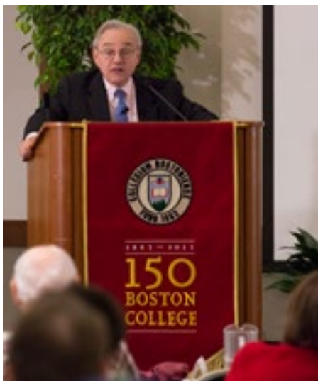
E.J. Dionne delivers the conference’s keynote address.