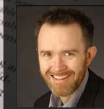
Rod Dreher American Conservative