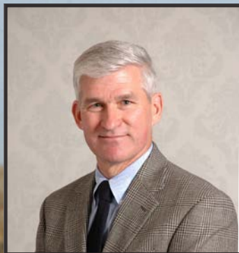
ANDREW BACEVICH Boston University