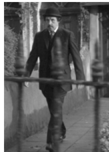
Stephen Rea in Bloom