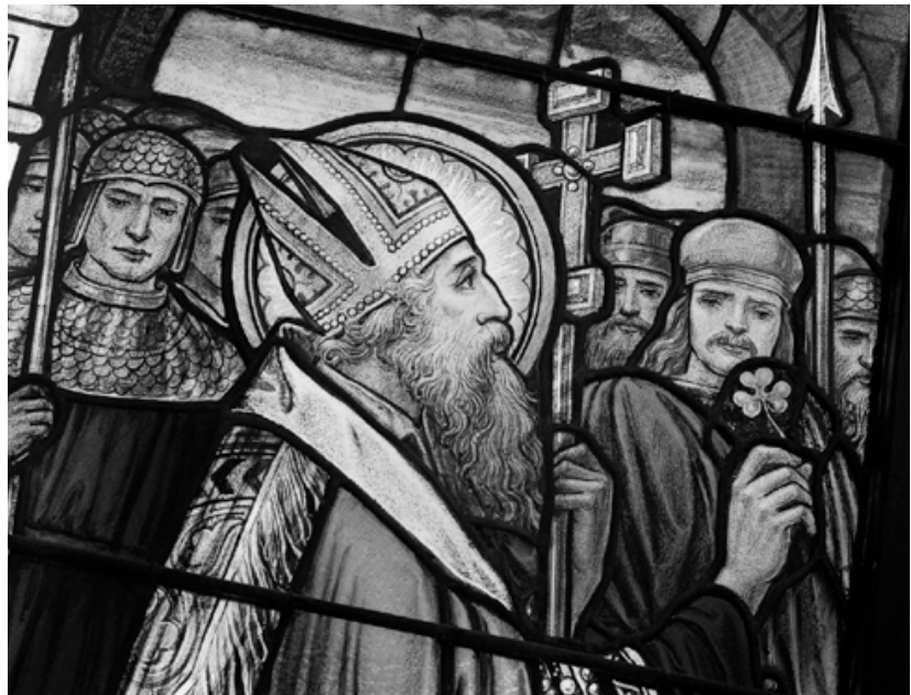
Detail of stained glass window, Connolly House