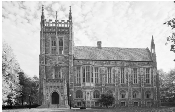
Burns Library, Boston College