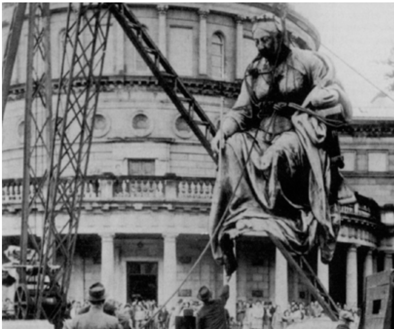
Removal of a statue of Queen Victoria from the Courtyard of Leinster House, Dublin, 22 July 1994.