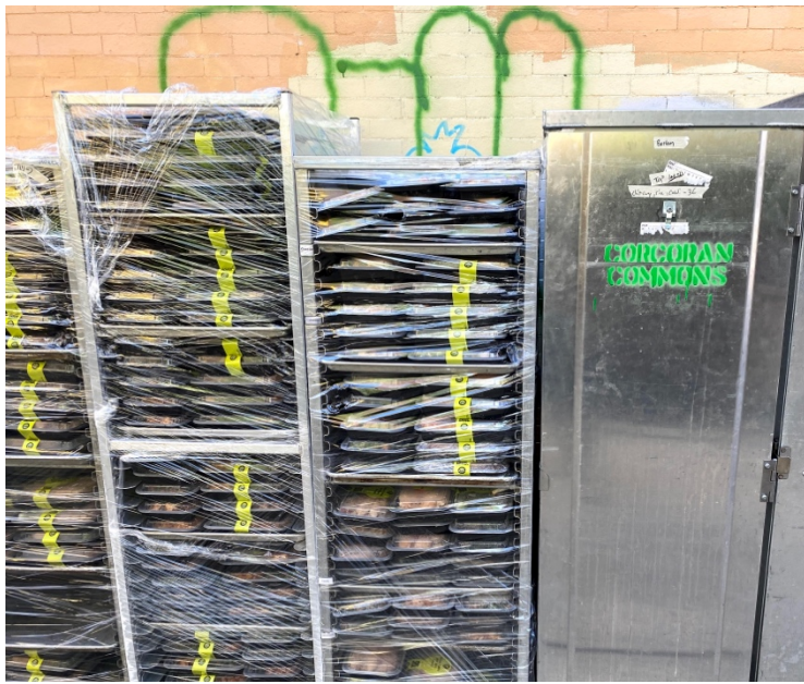
BC delivered meals and bread to the Commonwealth Kitchen, Dorchester