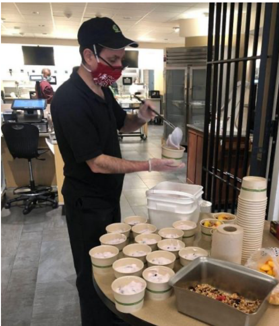
Greek yogurt parfaits with fresh fruit & granola to Boston Public Health Commission Shelter System.