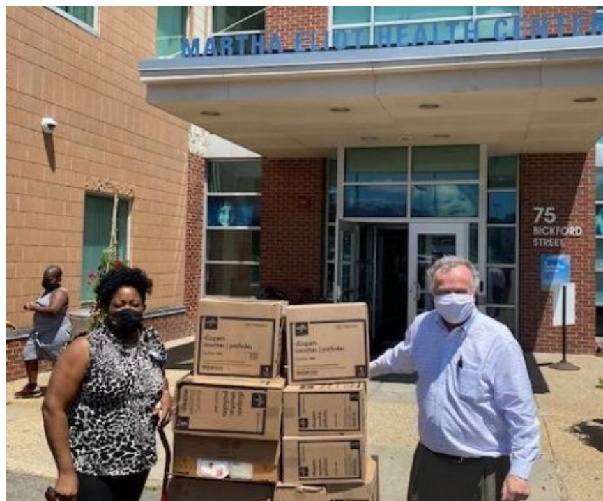
Martha Eliot Health Center, Jamaica Plain