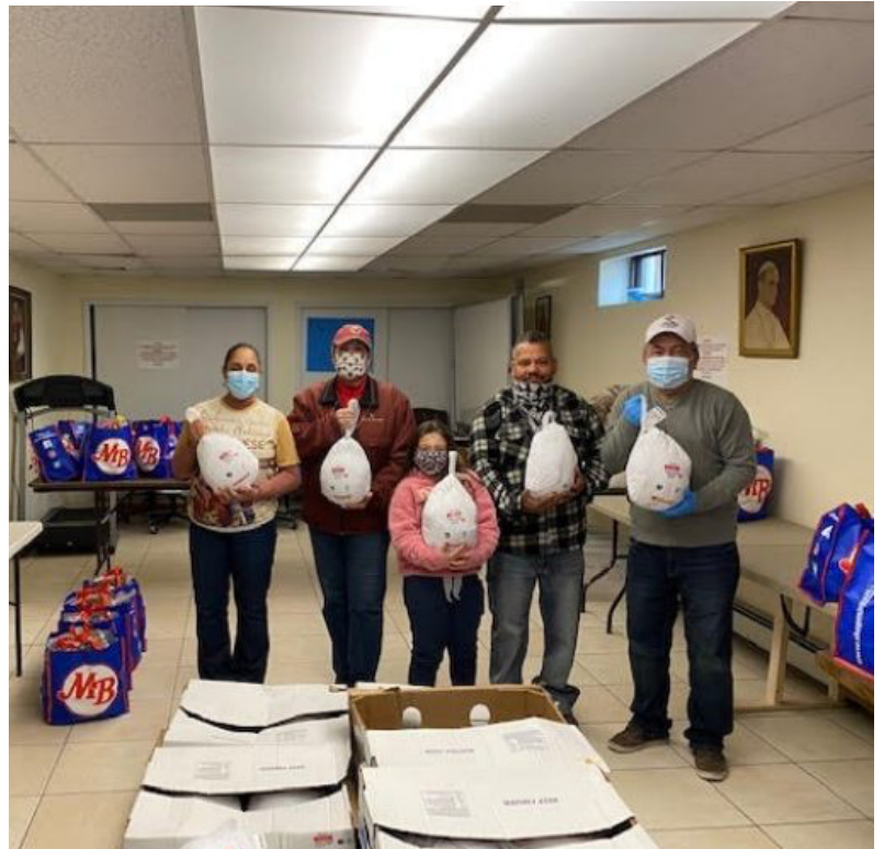
100 Frozen Turkeys at St. Anthony's Church