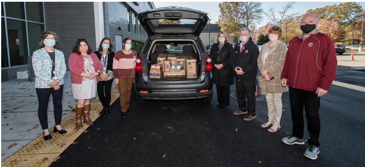
Delivered formula and diapers to Charles River Community Health Center, Brighton.