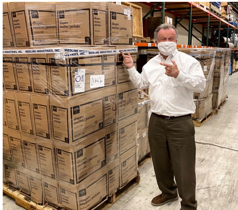
Diapers stacked at the BC warehouse