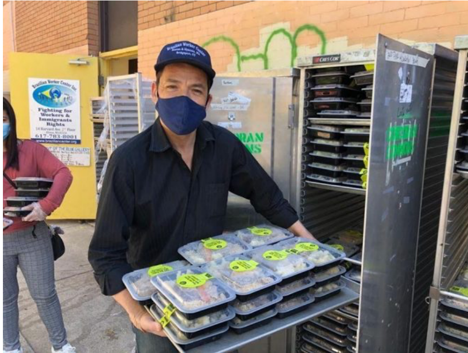
5,000 frozen meals to the Brazilian Worker Center, Allston

Commission Shelter System and the West End House. $25,000 to purchase high-demand grocery items such as bread, shelf-stable milk, yogurt, cheese, rice beans, and canned meat/chicken/protein for distribution to families in need at the sites mentioned above. Award: $50,000 Status: Complete