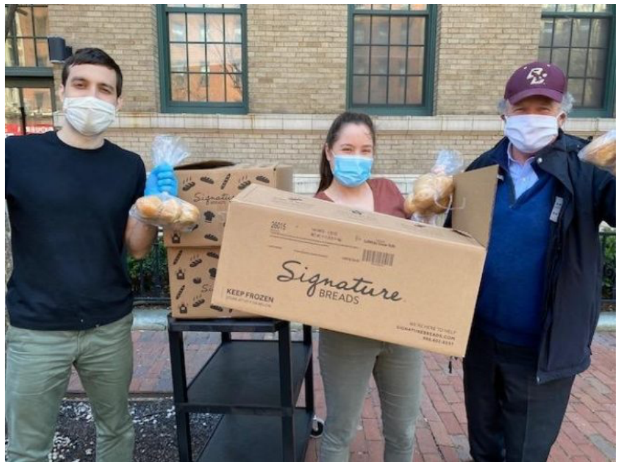
Sent fresh baked bread and rolls to Huntington Avenue YMCA for city wide distribution