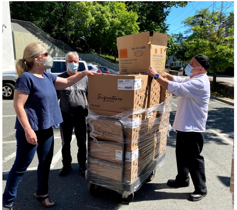
Meals, yogurt, bread and diapers to West End House, Allston