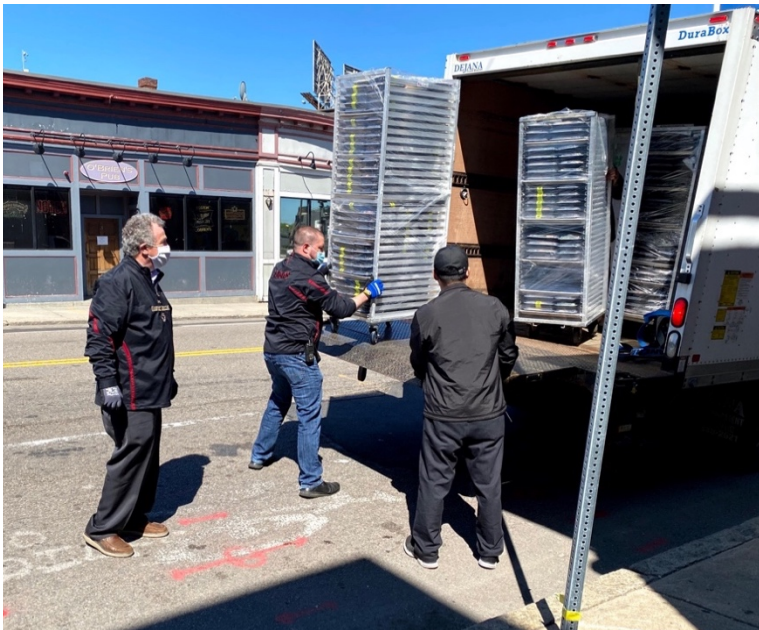
Wednesday delivery of frozen meals – Brazilian Worker Center