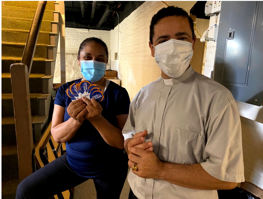
Gift cards to St. Anthony's Church Food Pantry, Allston