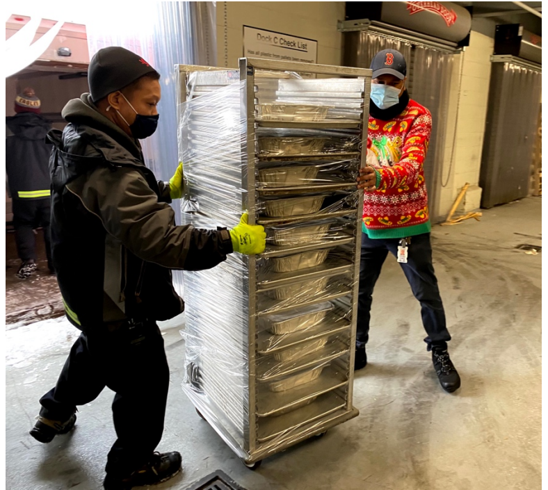
Delivering pulled pork trays at the Commonwealth Kitchen for Boston Public Health Commission Shelters