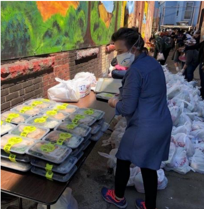
Brazilian Worker Center Food Pantry