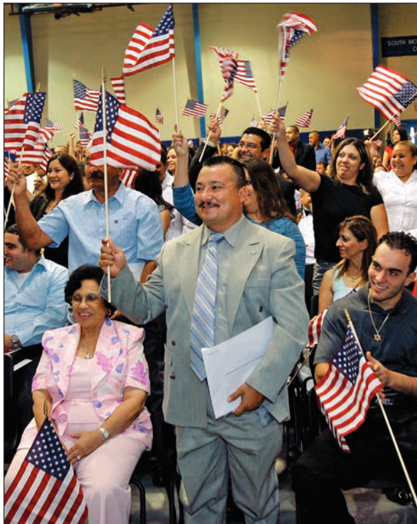
Mexican Americans celebrate their swearing-in as U.S. citizens in Phoenix, July 4, 2007.

associated with any such population movement, and often blinded by self-interest, these elites have refused to view this influx as anything other than a blessing to America's culture and a boon to the economy.