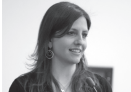
Rebecca Skloot addresses the crowd.