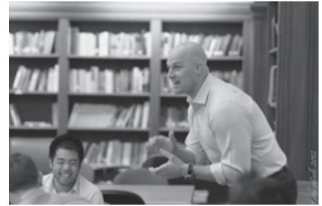
Brennan Symposium.

Without a doubt, he experienced phenomenal success as the quarterback of the Seattle Seahawks. Matt led the Seahawks to the playoffs in six different years, including