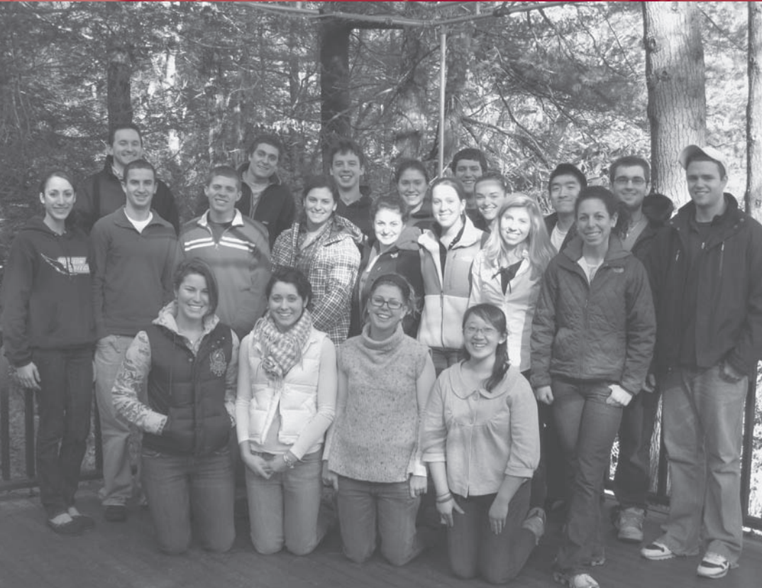
The 2008 Jenks Leadership Group at Whispering Pines Conference Center in West Greenwich, Rhode Island.

THE WINSTON CENTER FOR LEADERSHIP AND ETHICS