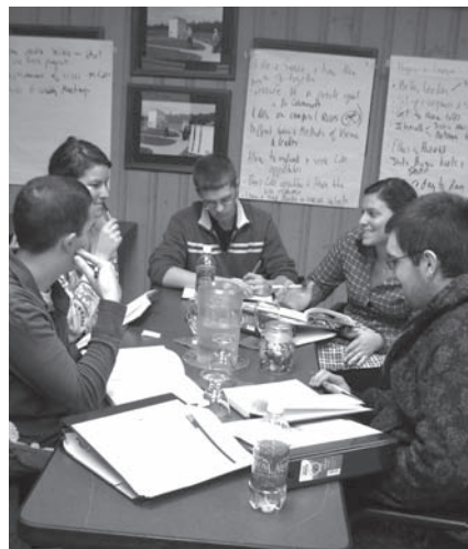
Jenks students at work during the retreat.